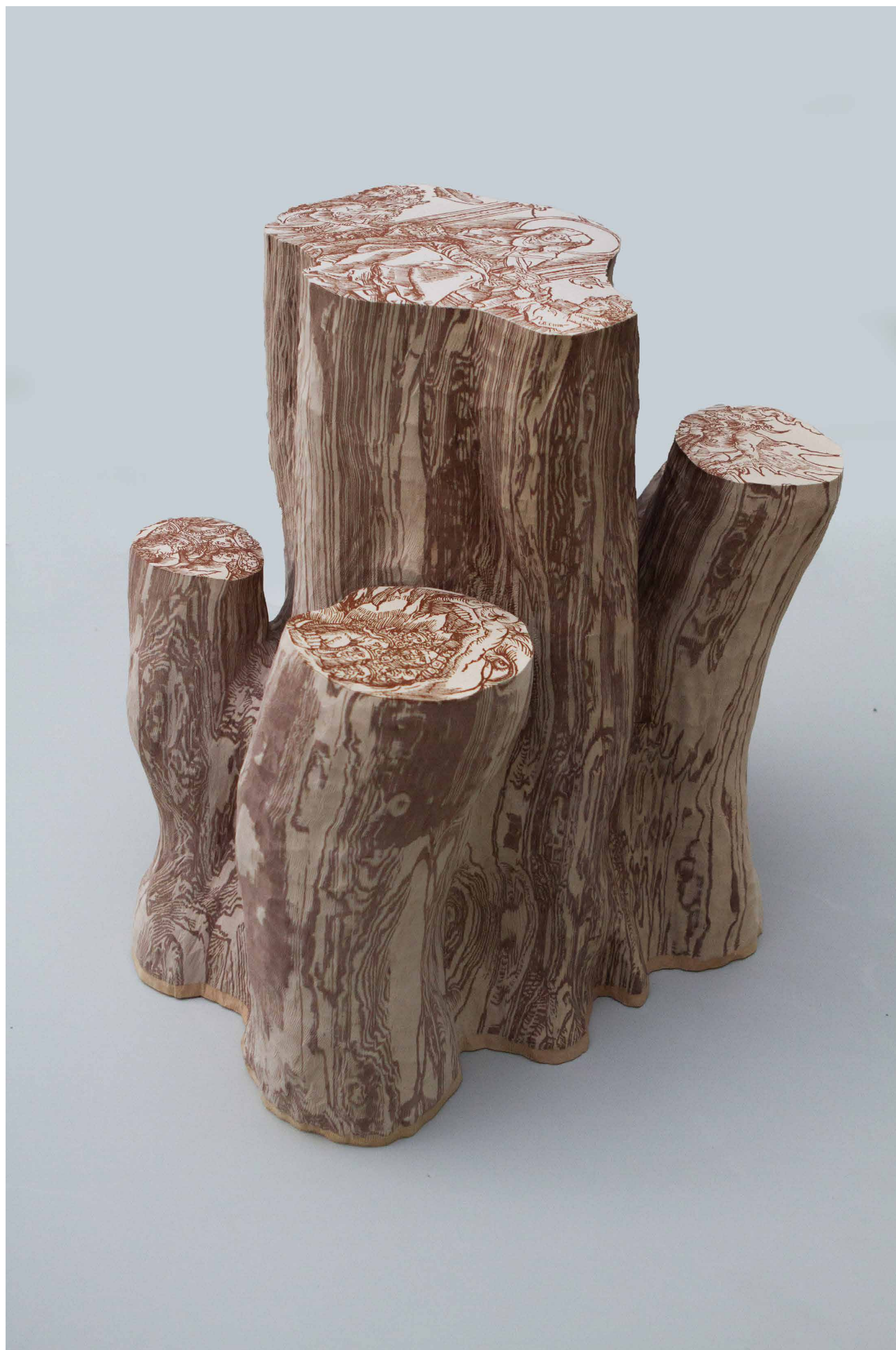
From the "Cimientos" series Árbol 3, 2022 Carving on stack of printed paper. 70 x 64 x 42 cm