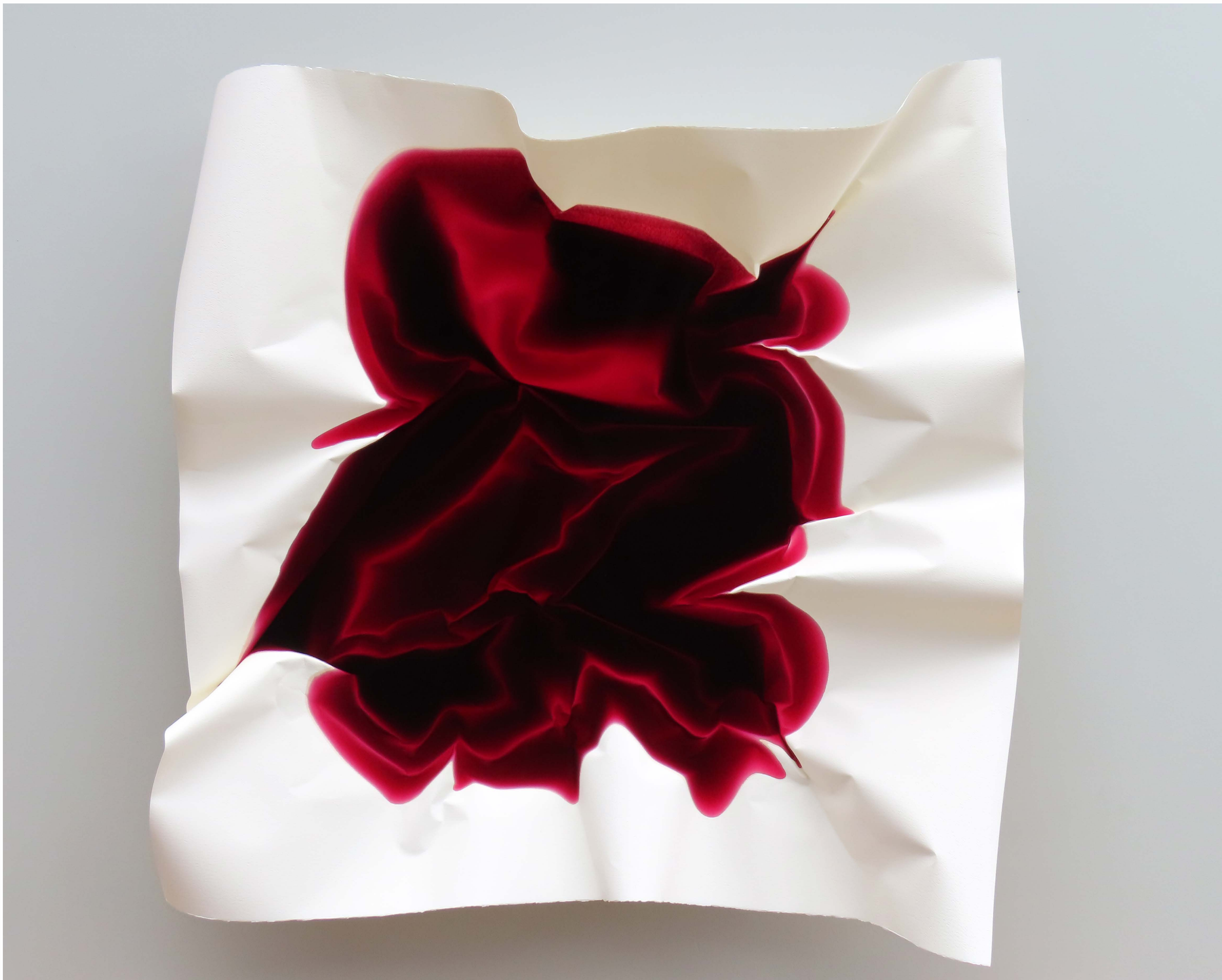
Lago de las ágatas, 2022 Epoxy resin casting on cotton paper 140 x 140 x 18 cm