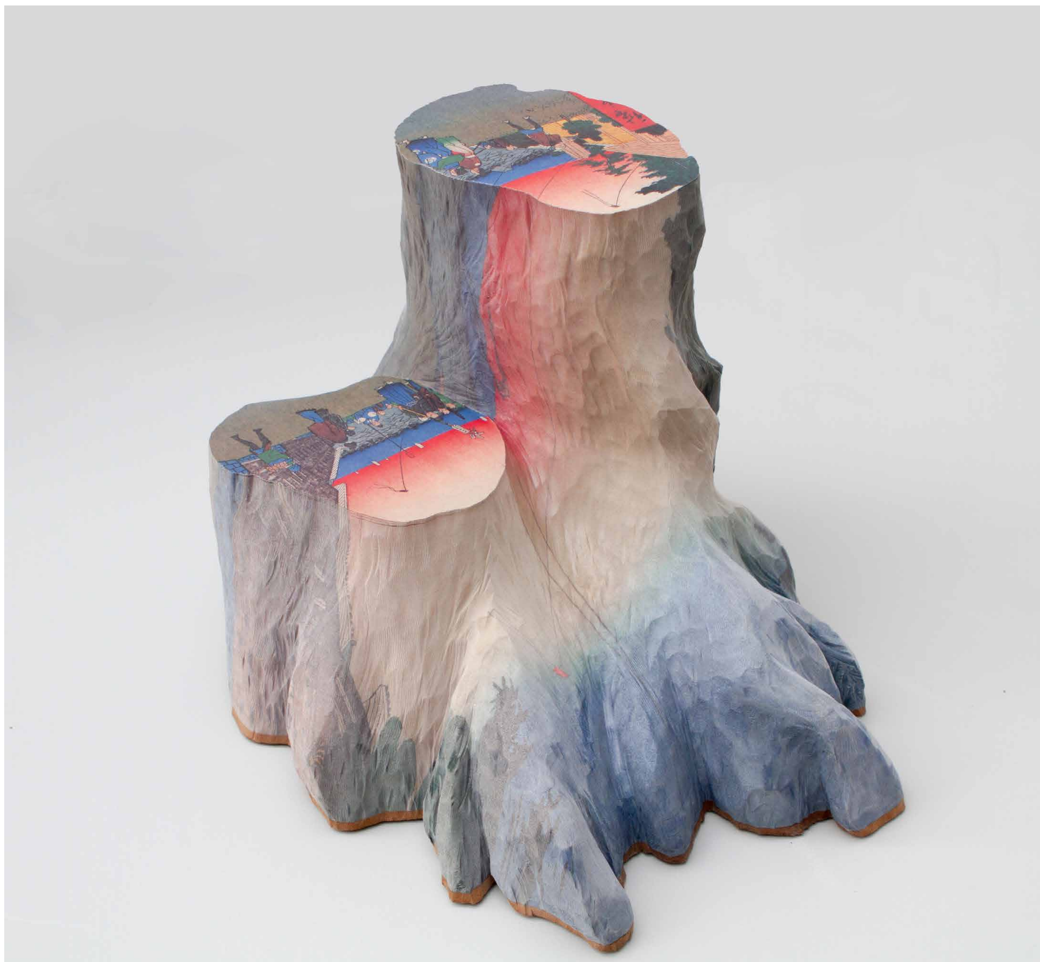
From the "Cimientos" series Tree #2, 2022 Carving on stack of printed paper. 44 x 62 x 42 cm