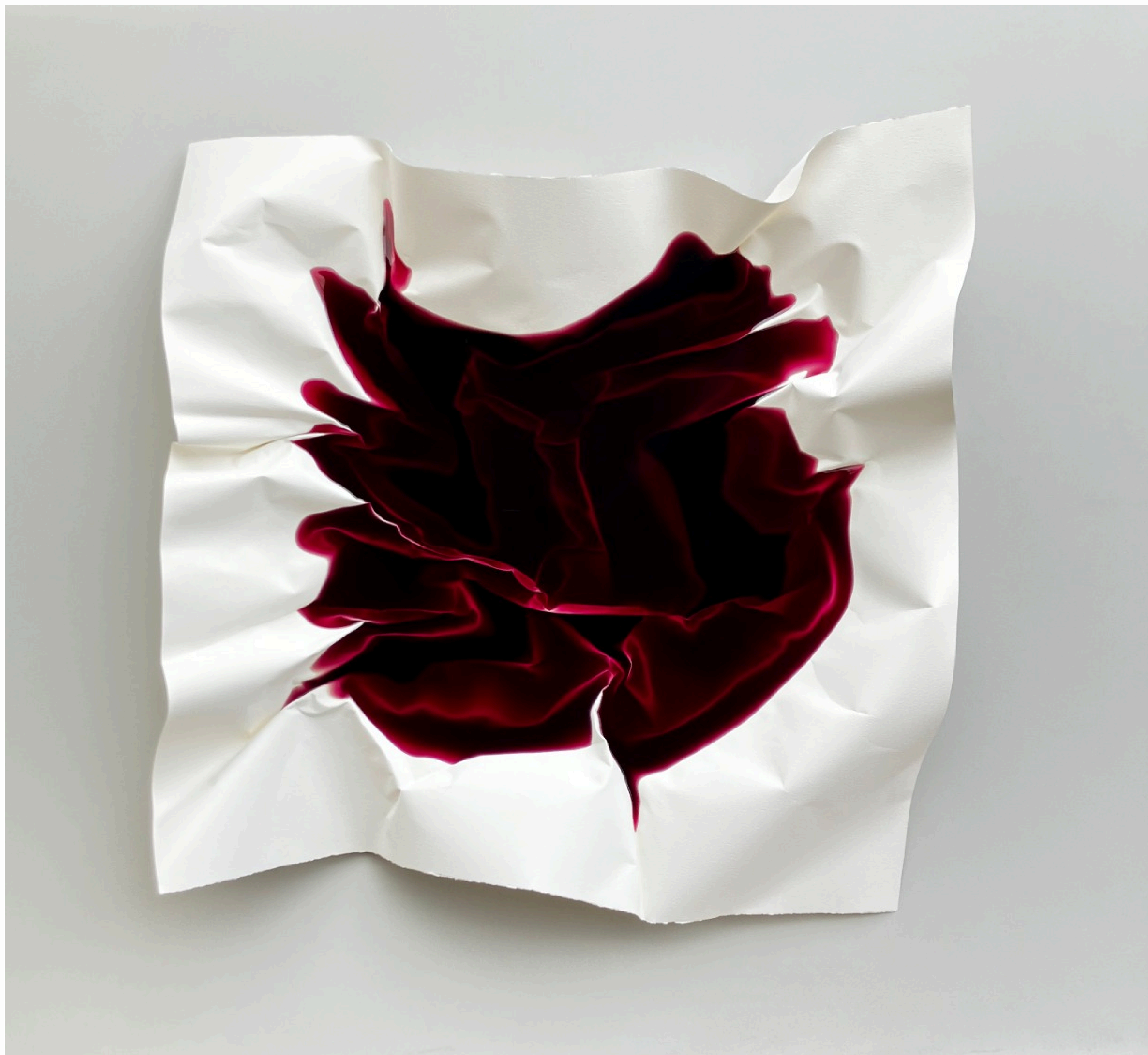
Lago Cheshire, 2022 Epoxic resin casting on cotton paper 140 x 140 x 18 cm