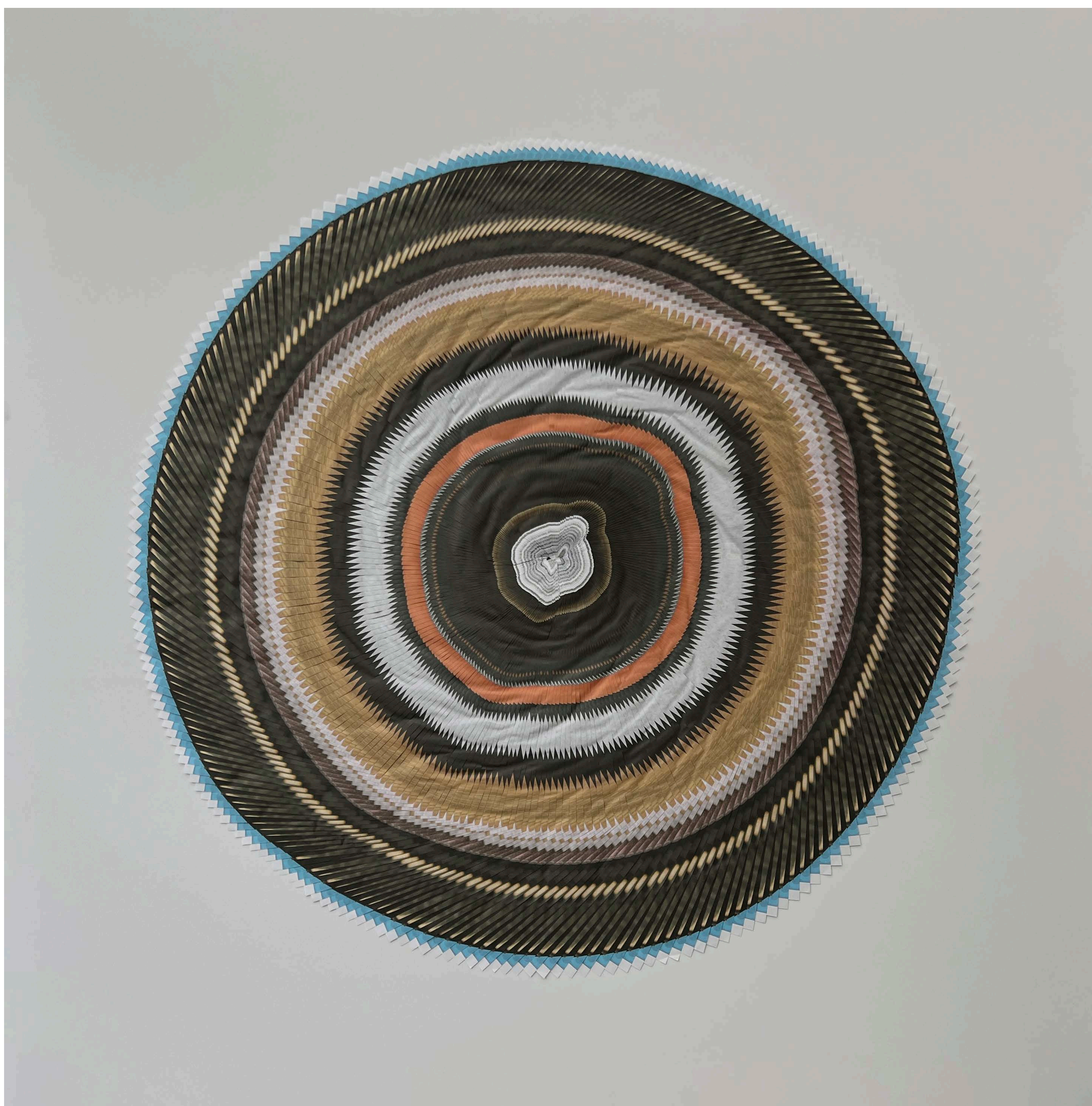
Corazón de Macayepo, 2022 Collage made from printed newspaper 120 x 120 cm