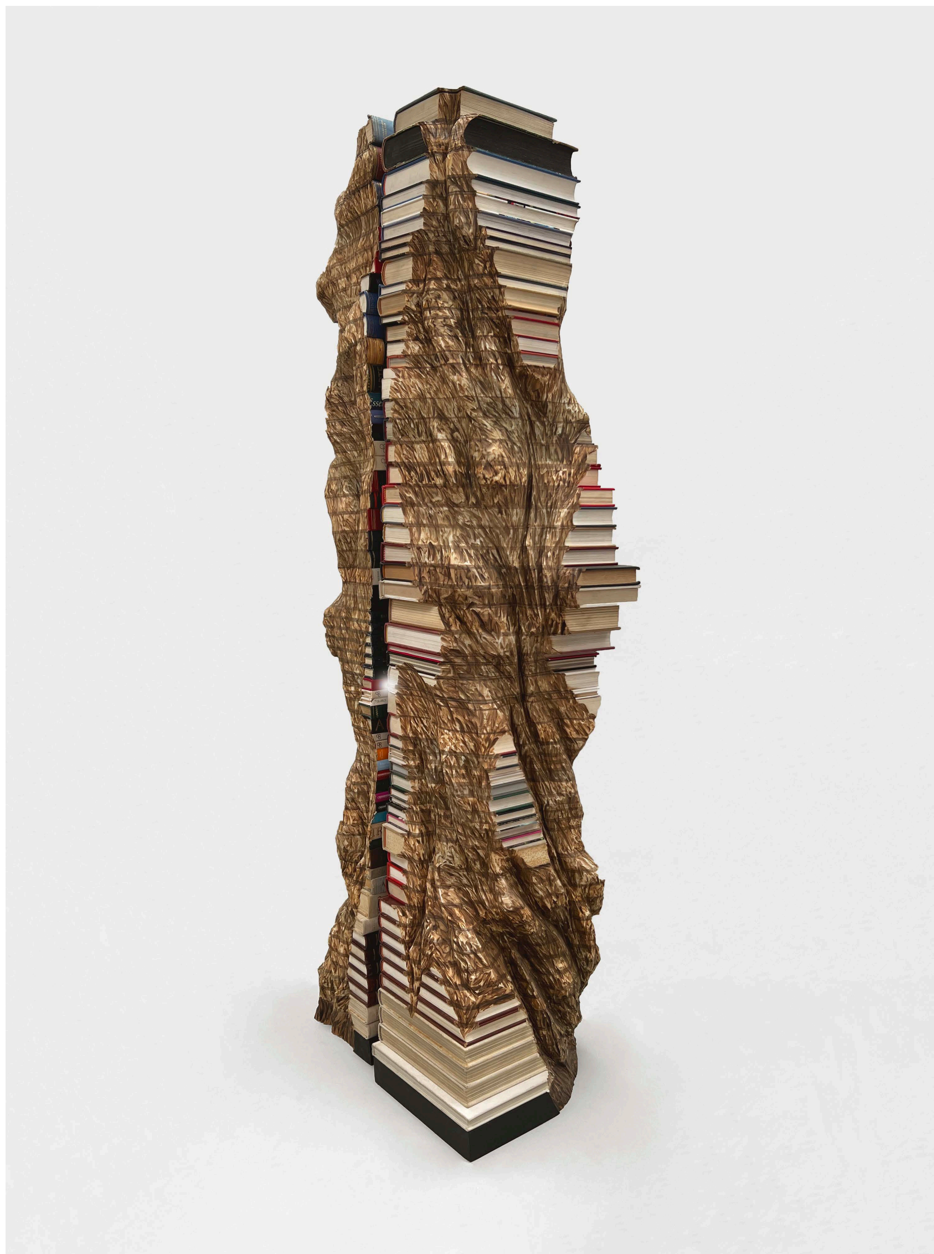
From the Series "El papel lo aguanta todo" The Tree of Mimesis and Diegesis, 2022 Stacked and carved architecture books 175 x 63 x 41 cm