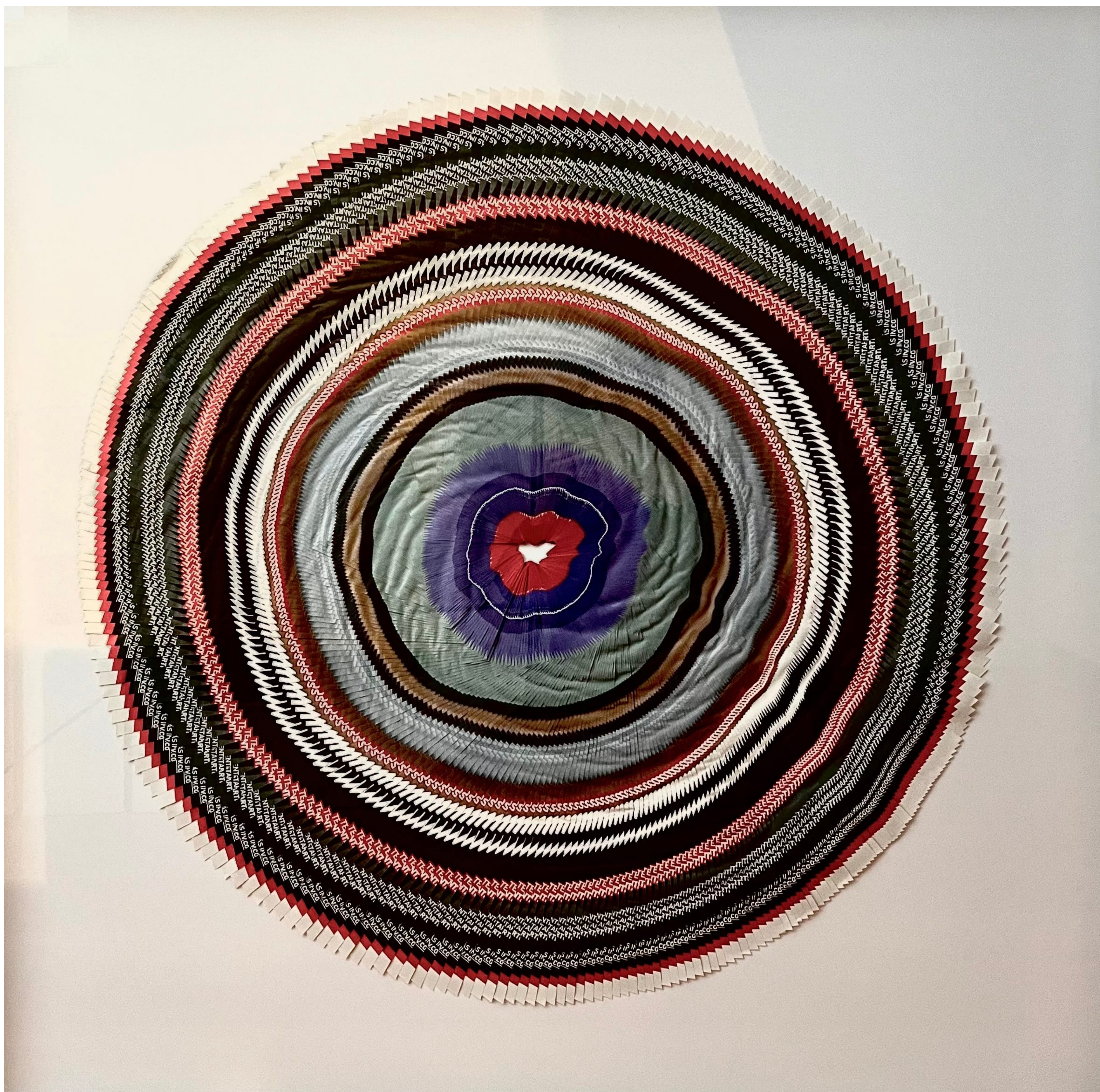
Anillo Las ondas de la boca vibrante, 2022 Collage made from printed newspaper 120 x 120 cm