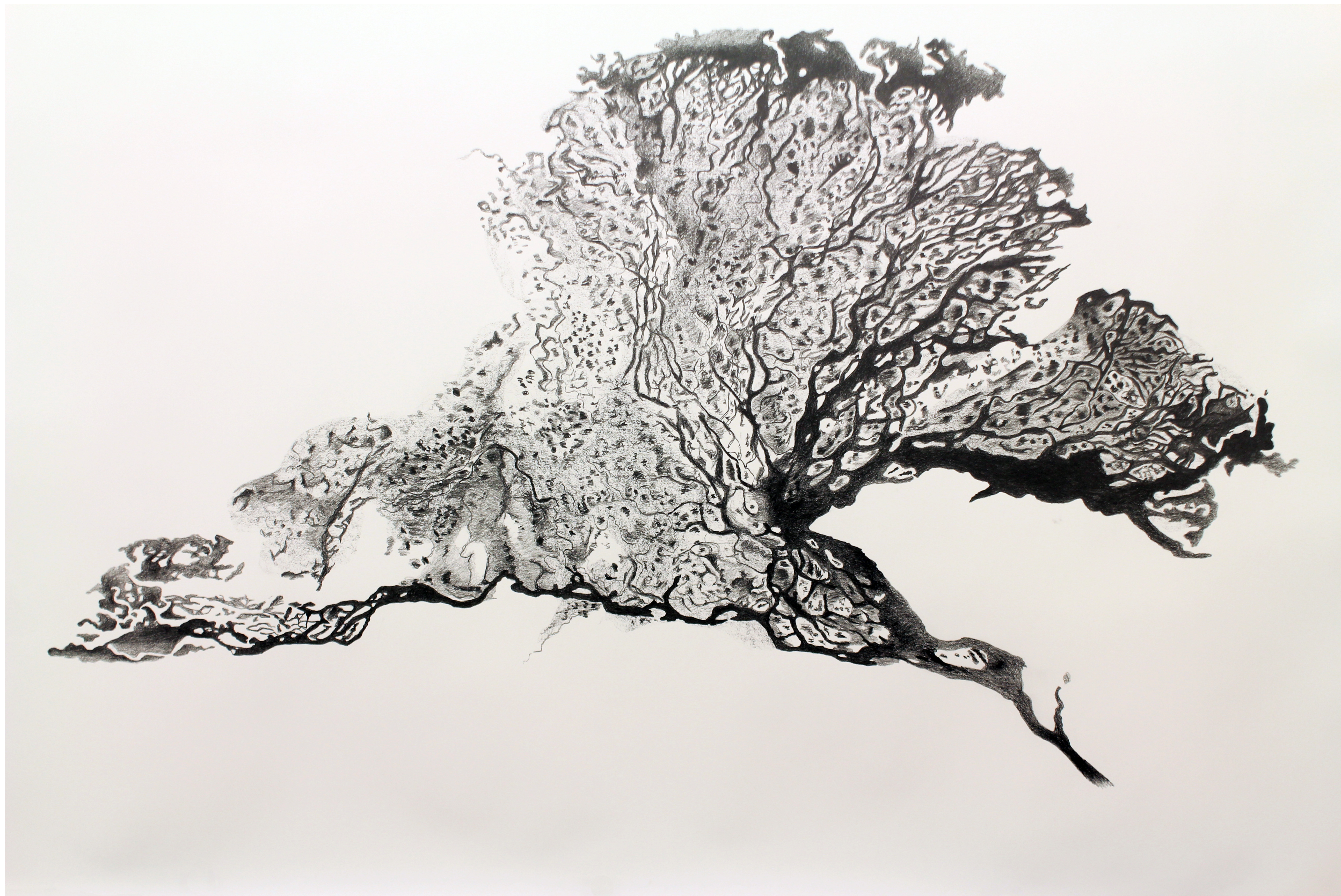
El gran árbol del agua: El árbol de Lena, 2013 Graphite on paper 150 x 224 cm