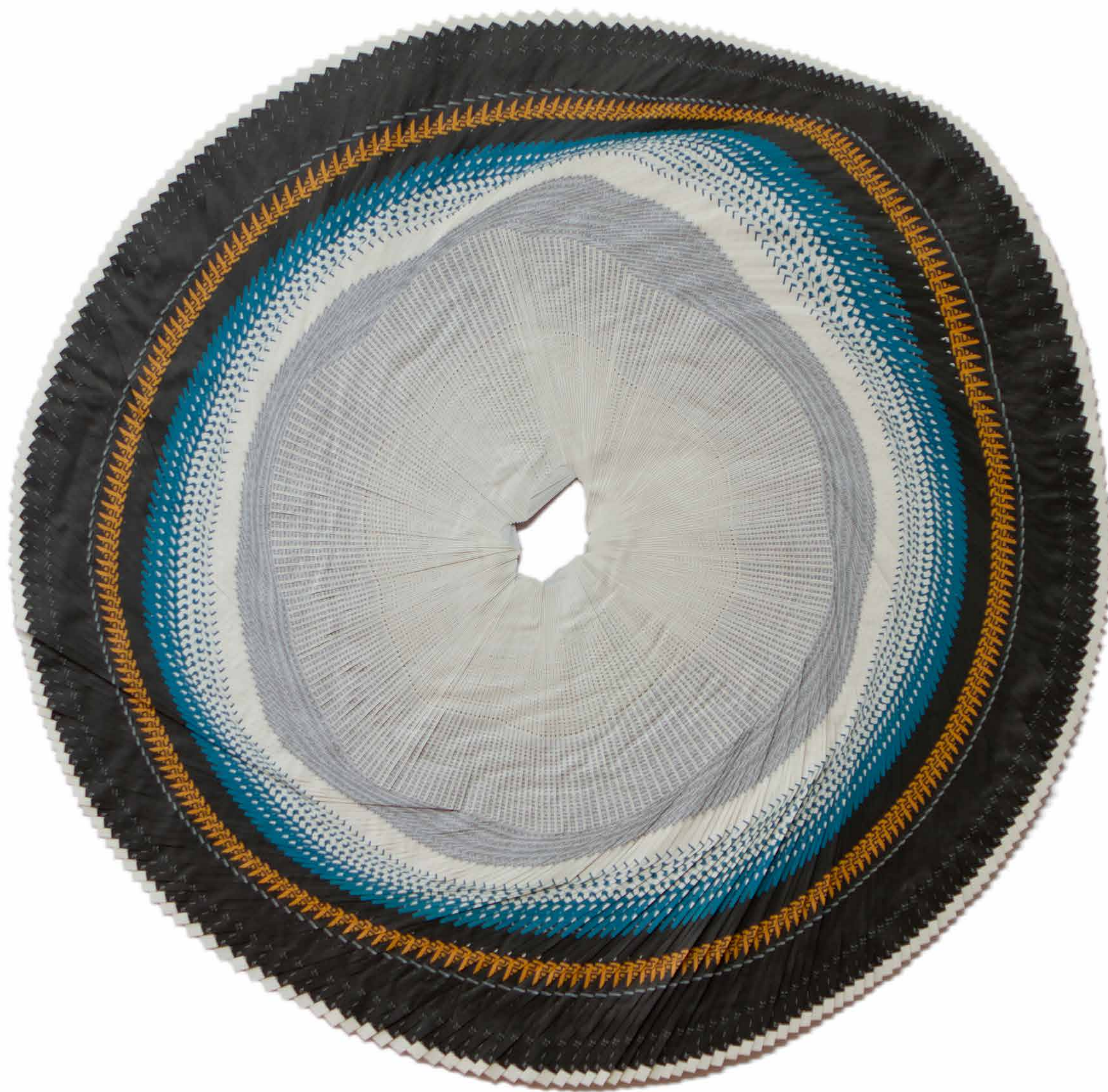
Anillos calientes, 2022 Collage made from printed newspaper 120 x 120 cm