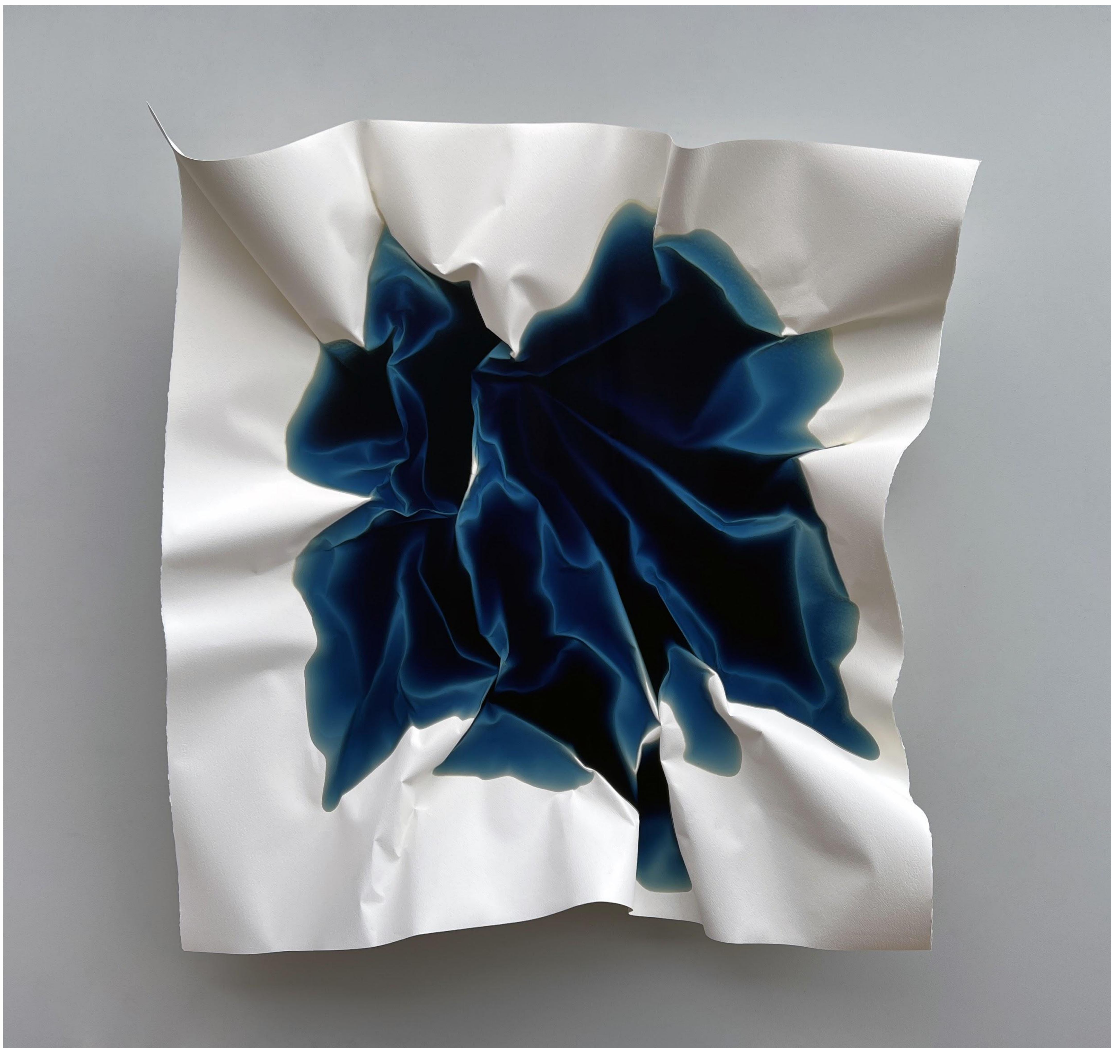
Lago de las Náyades, 2022 Epoxy resin casting on cotton paper 140 x 140 x 18 cm