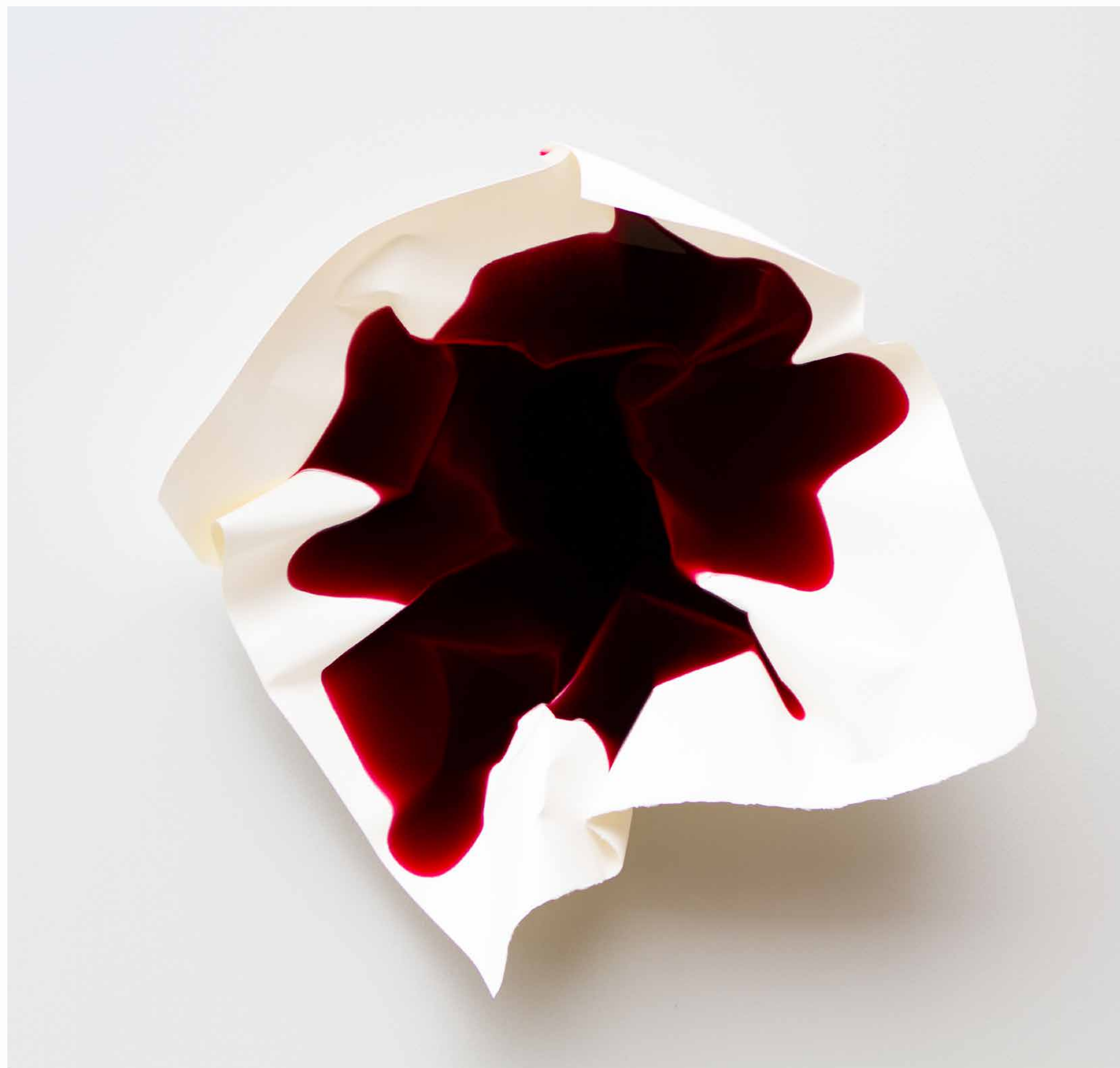
El Lago de las 7 lagunas, 2022 Epoxy resin casting on cotton paper 60 x 61 x 23 cms