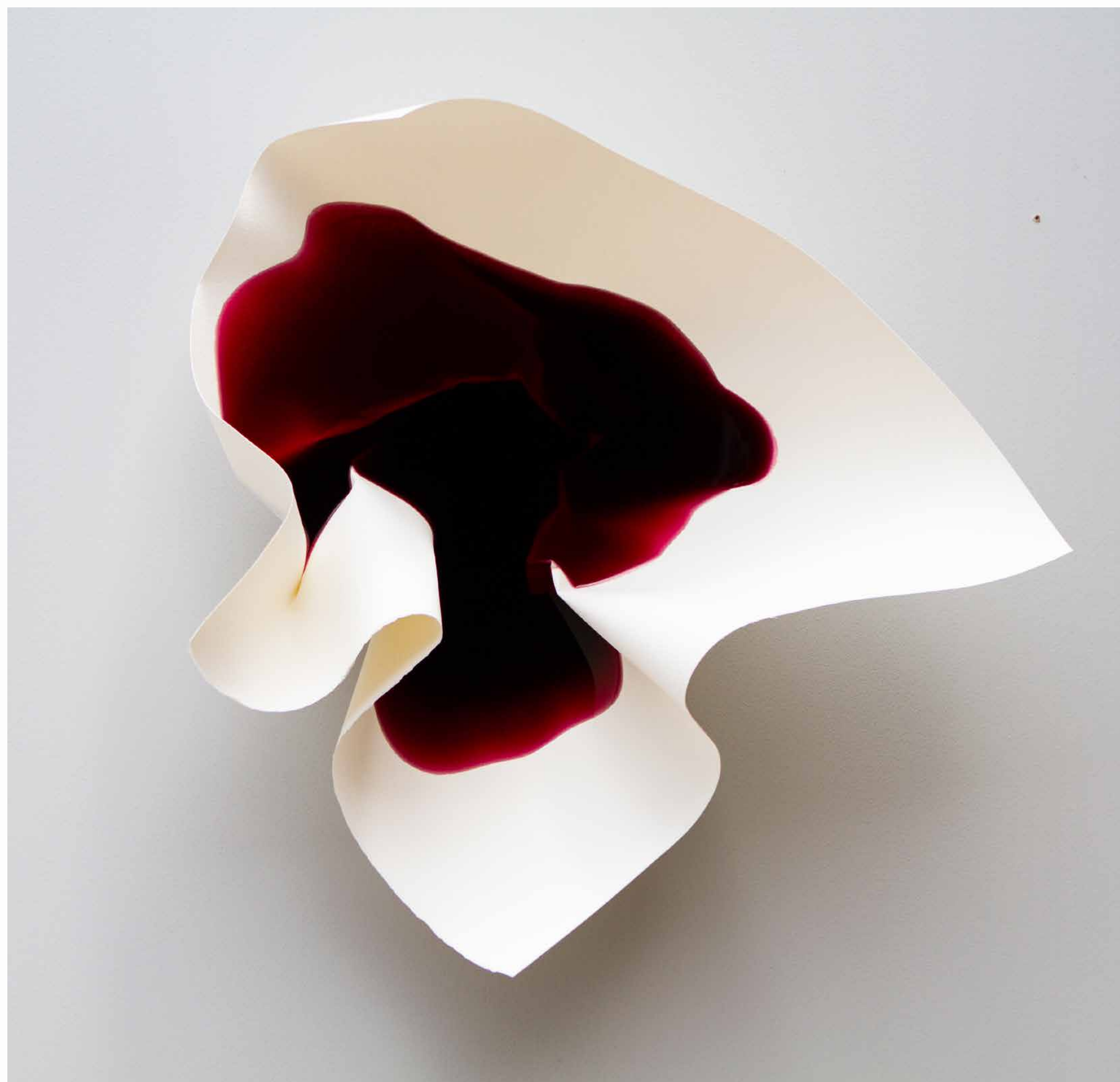
Lago del oidor, 2022 Epoxy resin casting on cotton paper 65 x 65 x 25 cm