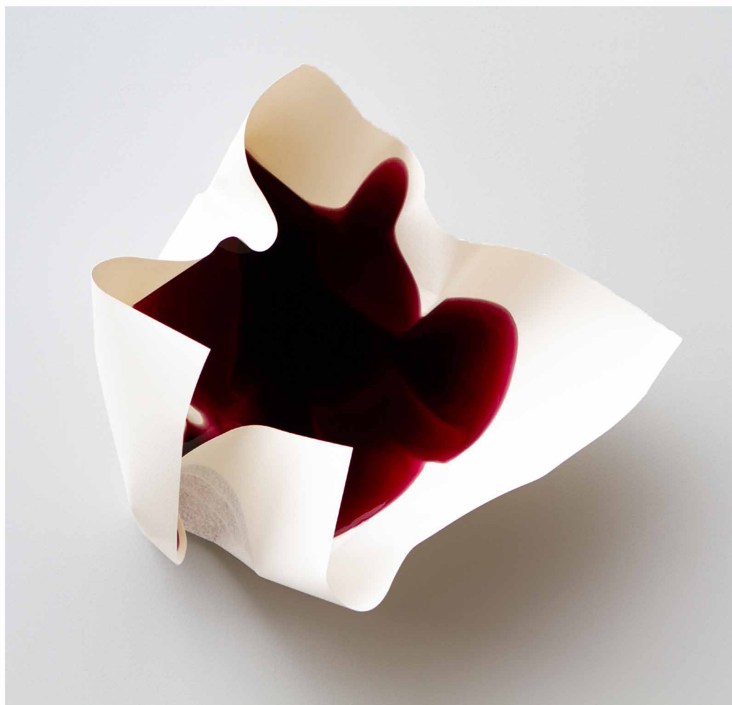
Lago del conejo inquieto, 2022 Epoxy resin casting on cotton paper 60 x 61 x 23 cm