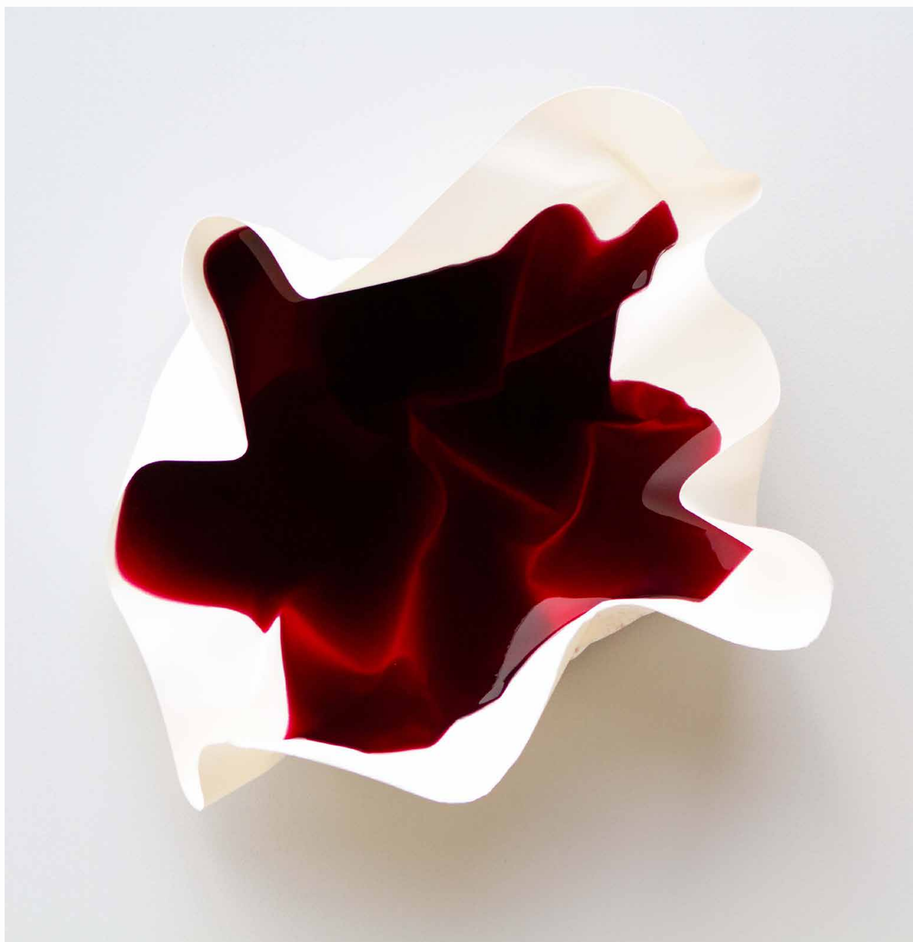
Lago del yelmo, 2022 Epoxy resin casting on cotton paper 61 x 60 x 23 cm