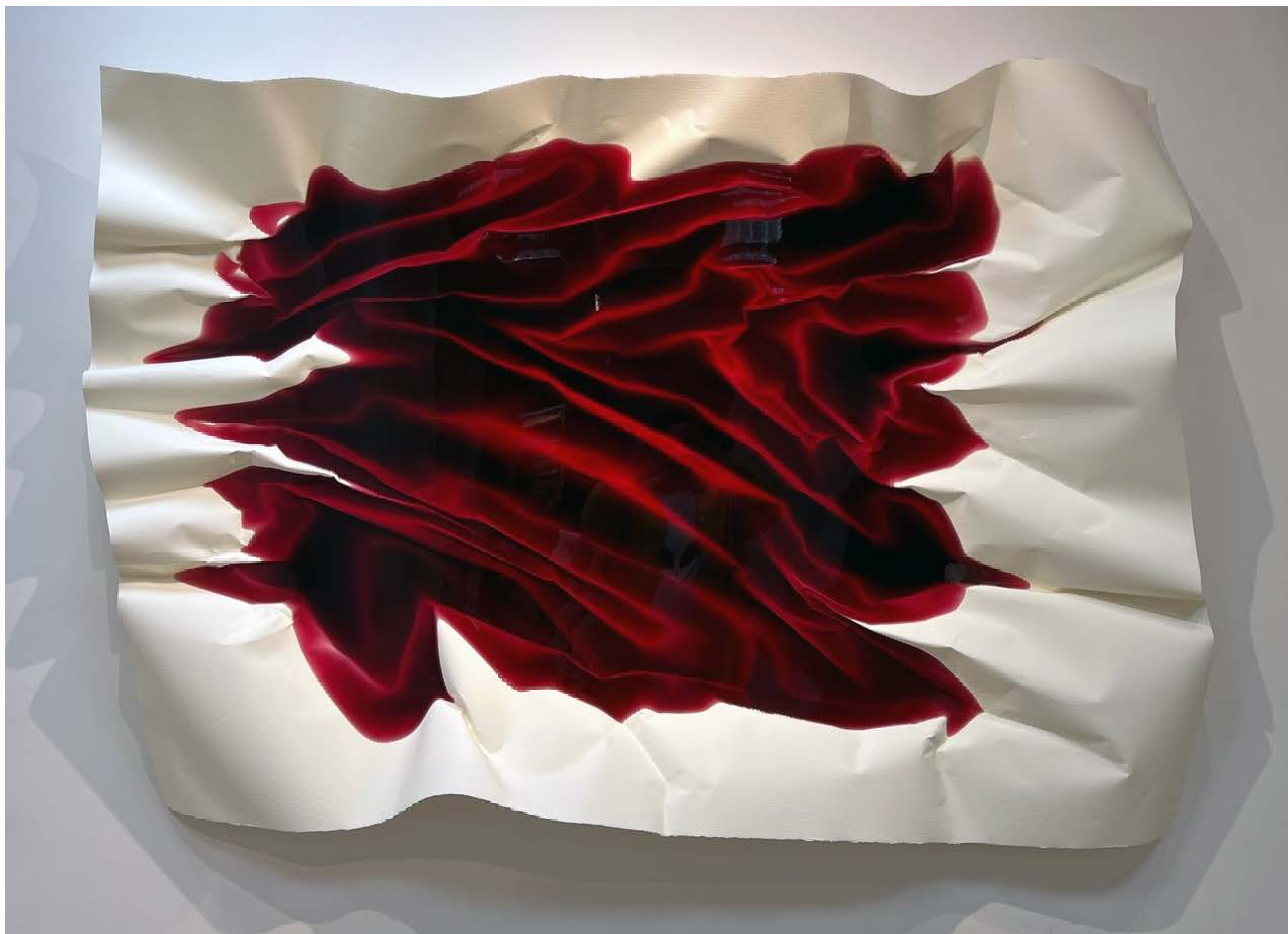
El lago vigoroso, 2023 Epoxy resin casting on cotton paper 120 x 180 x 25 cm