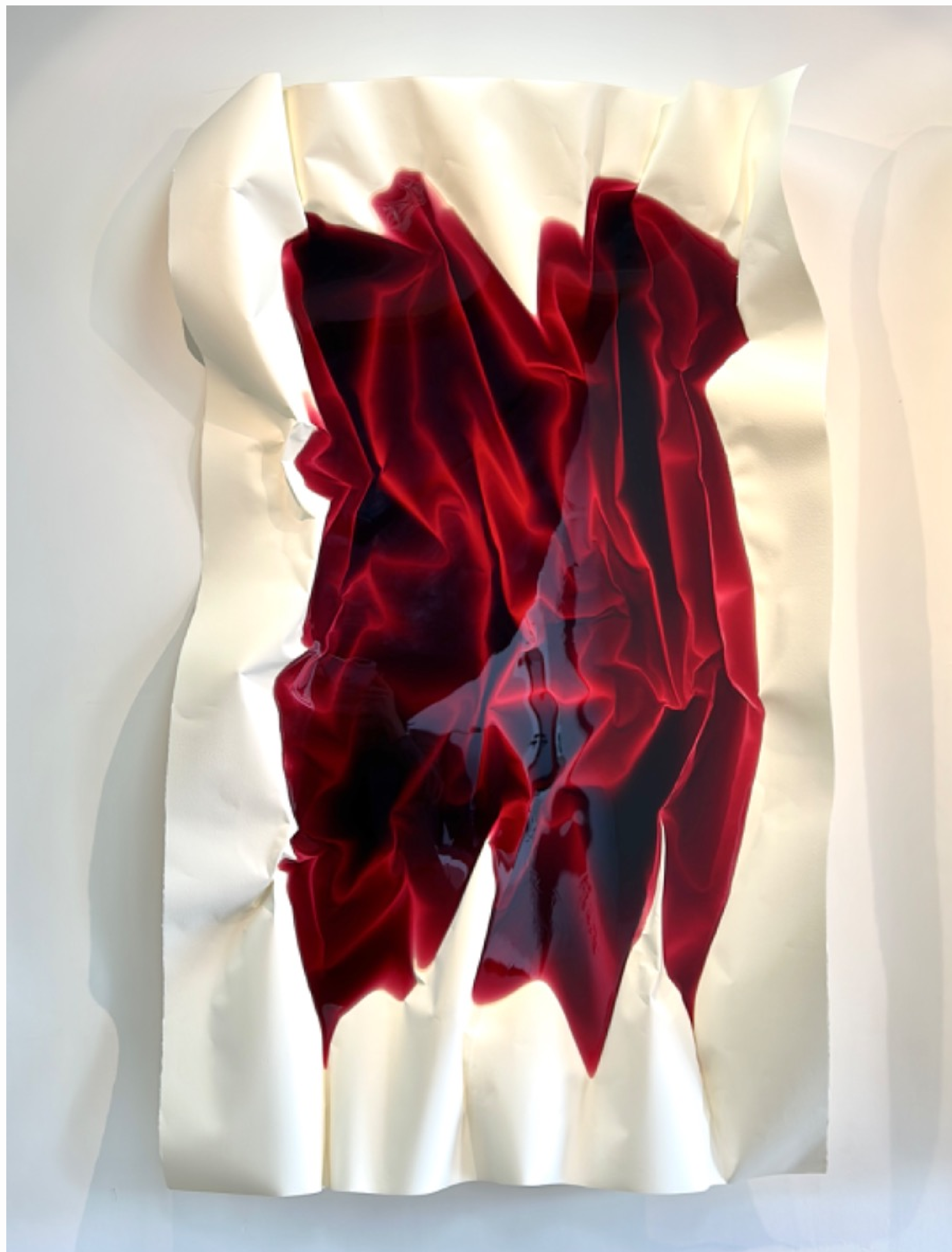
El Lago de los duendes, 2023 Epoxy resin casting on cotton paper 194 x 110 x 27 cm