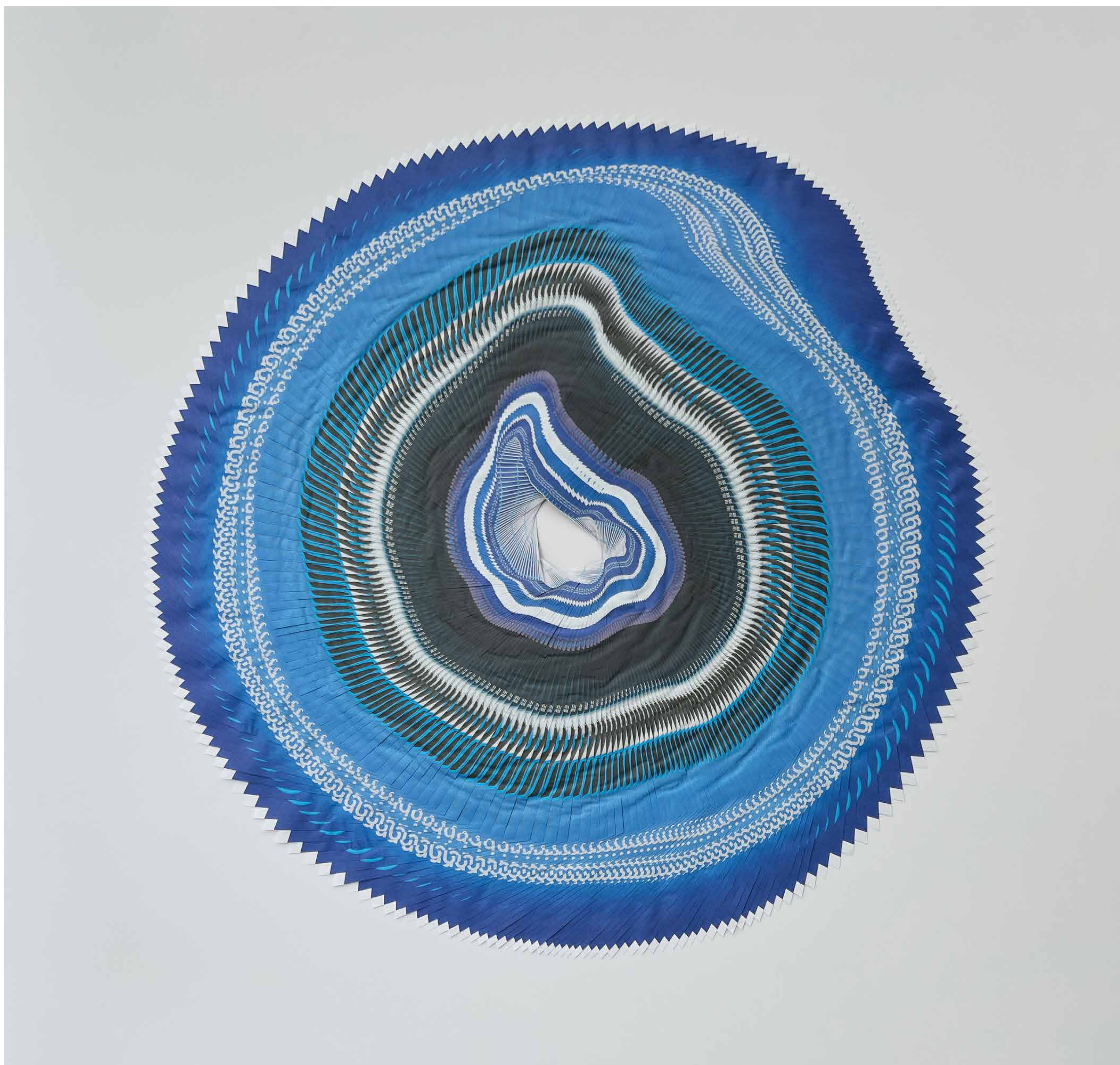
Los anillos de siempre, 2022 Collage made from printed newspaper 120 x 120 cm