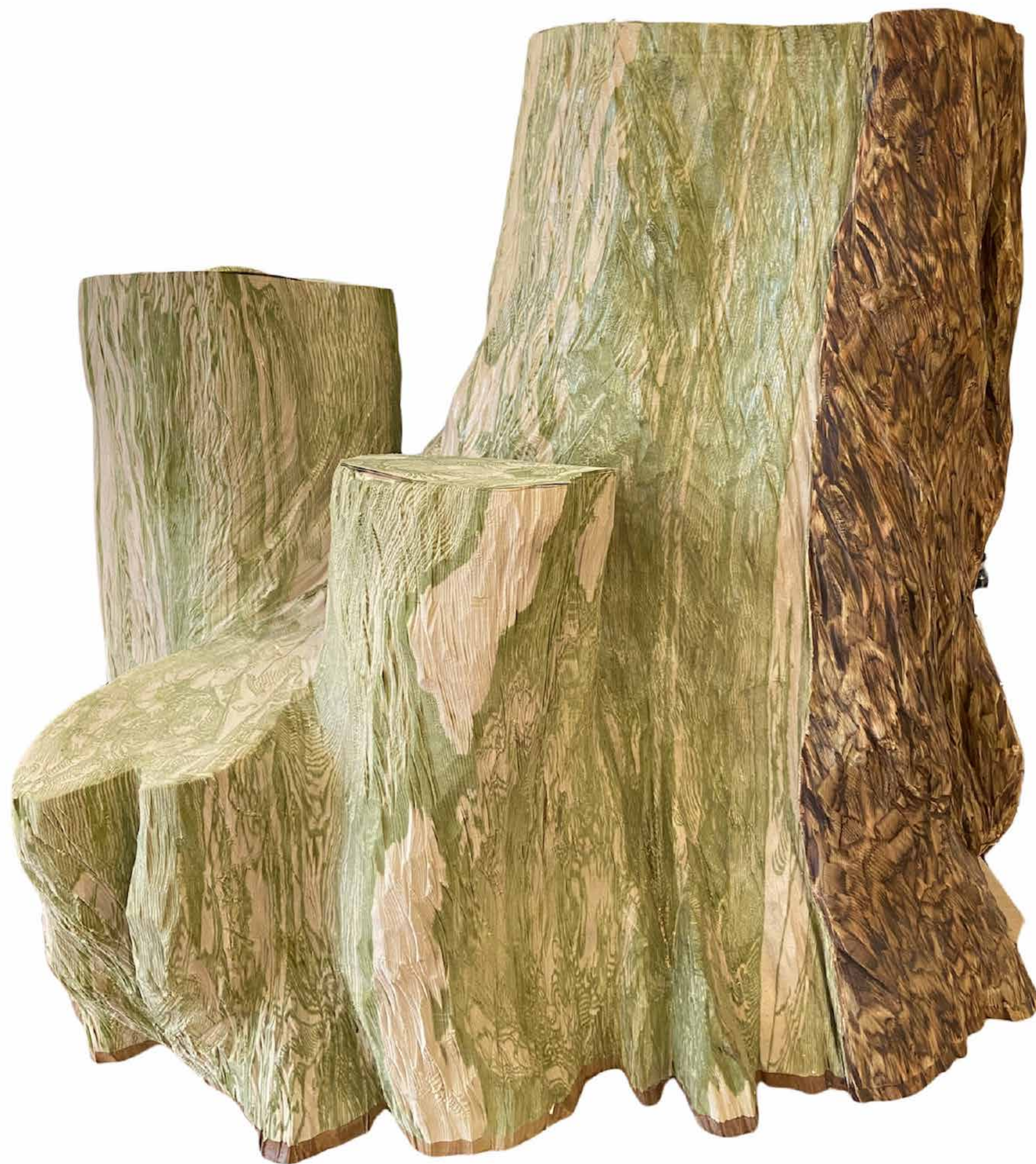
From the "Cimientos" series La coronación, 2022 Carving on stack of printed paper. 65 x 45 x 63 cm