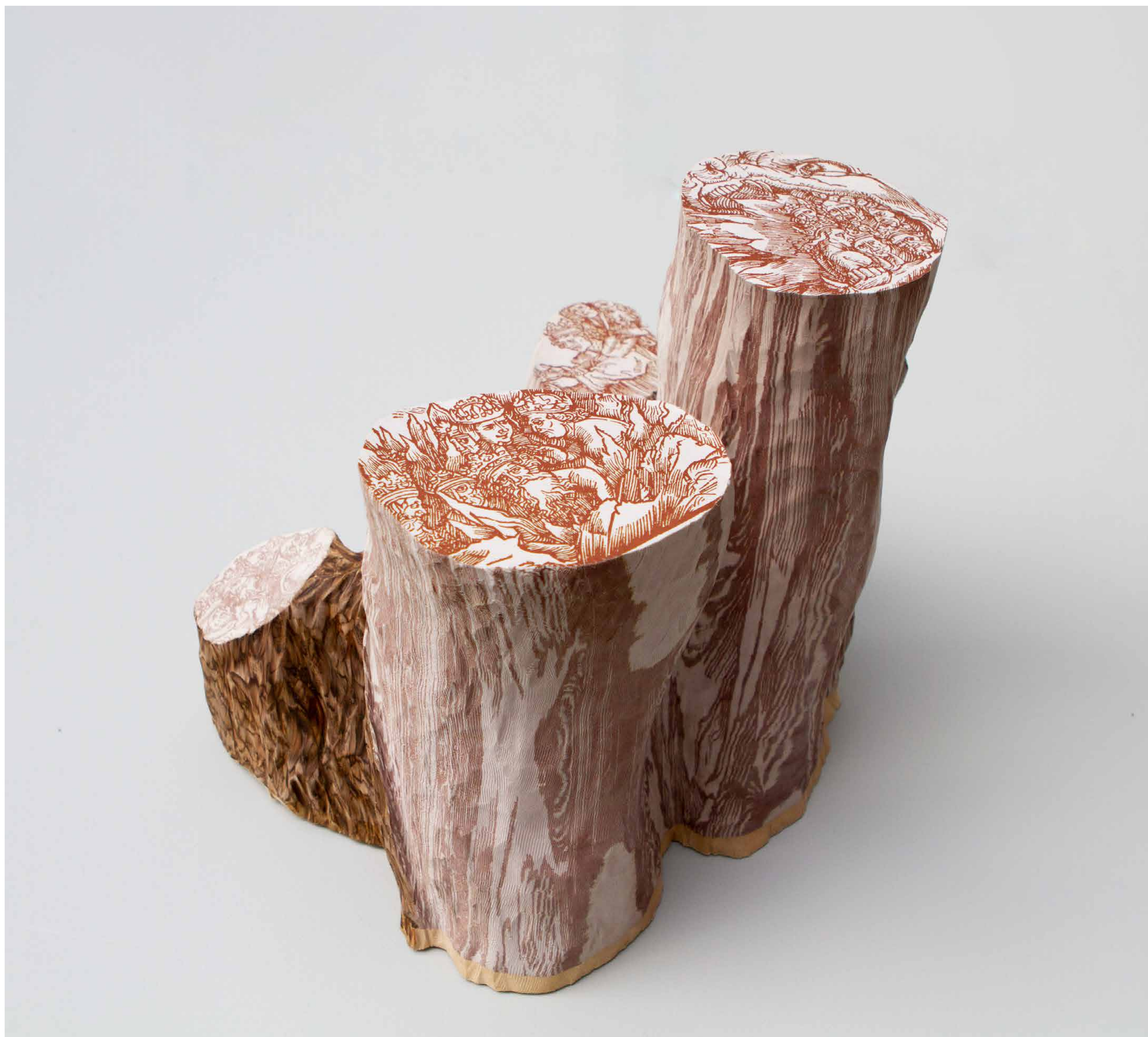
From the "Cimientos" series Tree #1, 2022 Carving on stack of printed paper. 42 x 44 x 41 cm